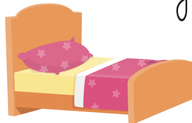
Jet [ i lunc ]