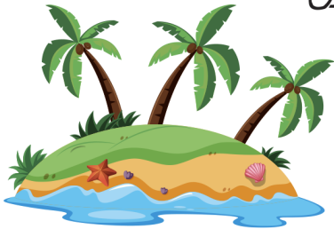
Isule [ i ]