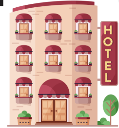
Hotel [ ache ]