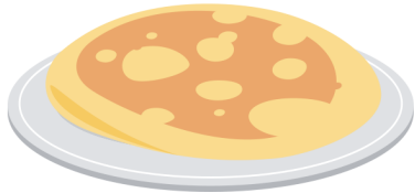
Frico [ efe ]